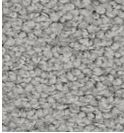
717 Grey Haze