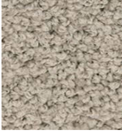
550 Soft Leather