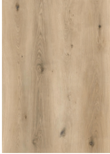
300 Natural Oak