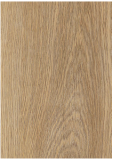
520 Copper Oak