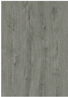
750 Ash Oak