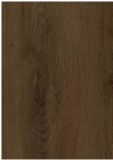
180 Toasted Oak