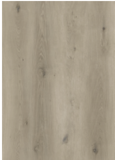
710 Silk Oak