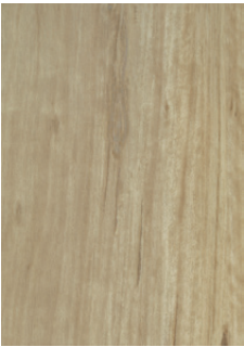
505 Lime Washed Blackbutt