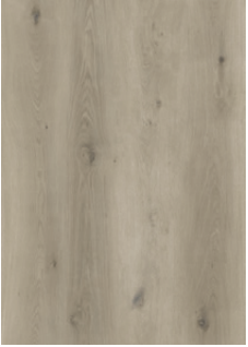
710 Silk Oak