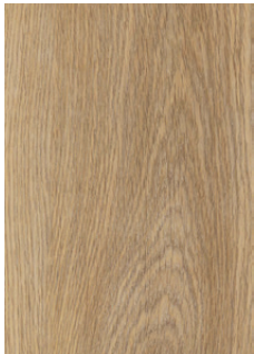
520 Copper Oak