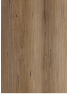
540 Weathered Gum