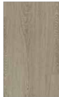
7001 SILVER BELL