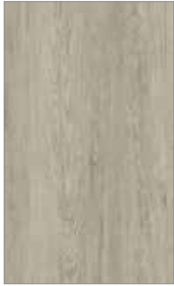
1001 GREY MIST