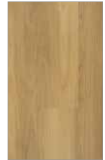
545 COASTAL BLACKBUTT