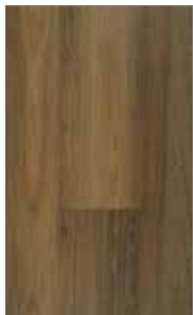
555 QLD SPOTTED GUM