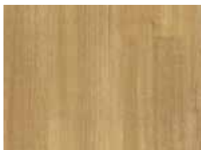
515 Tassie Oak