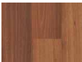
655 Forest Red